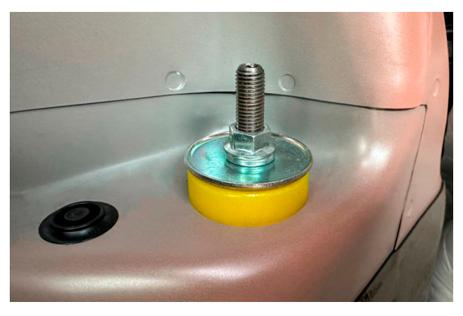
Figure 1 - fitted image