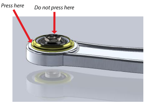
Figure 1 - showing the larger diameter on the upper face of the arm